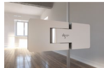
MARCATO Motion Closing speed (re) adjustable at any time.