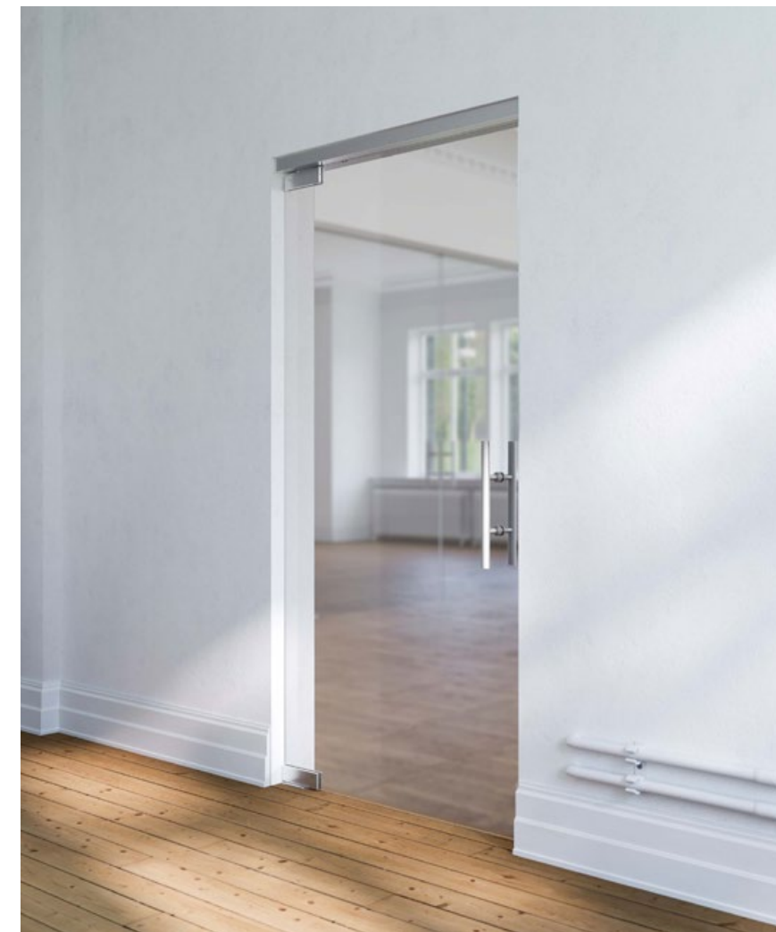
RP As an alternative to UNIVERSAL patch fittings, the double- action door can also be fitted with MUNDUS patch fittings on special request.