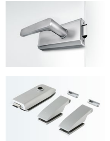
◀ STUDIO Gala 2.0 is available in versatile locking variants. At unlockable latch locks the lever handle can be positioned in the front or back.