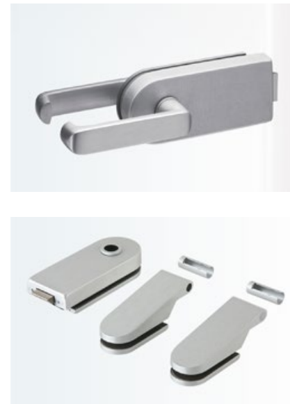
◀ STUDIO Rondo The locks match with STUDIO Rondo hinges as well as with the strong Office Junior hinges.