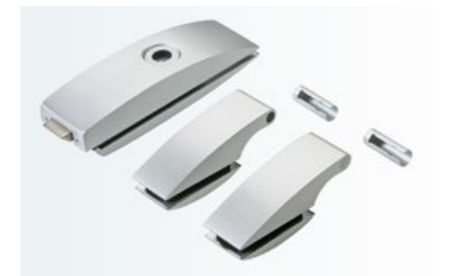
◀ STUDIO Arcos Lock, hinges and lever handle showing the arch shape typical for Arcos.