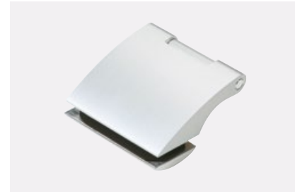
◀ Powerful sign The Arcos design also convinces at the OFFICE locks and hinges.