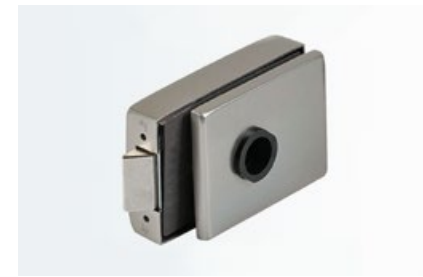
◀ STUDIO Medio It is often the little things that make life more beautiful. This certainly applies to STUDIO Medio.