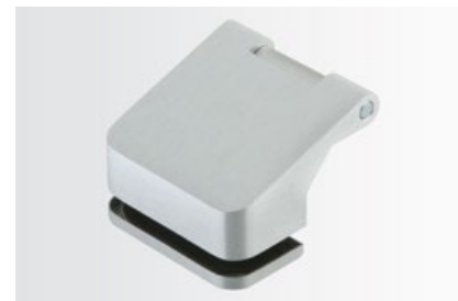
◀ OFFICE Junior Suitable for high frequency private and public spaces.