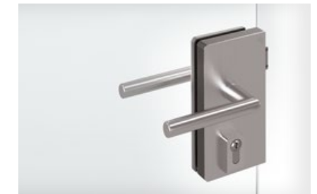
▶ OFFICE Mundus Well considered design, coherent across applications.