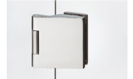
◀ OFFICE Classic Built for high endurance.