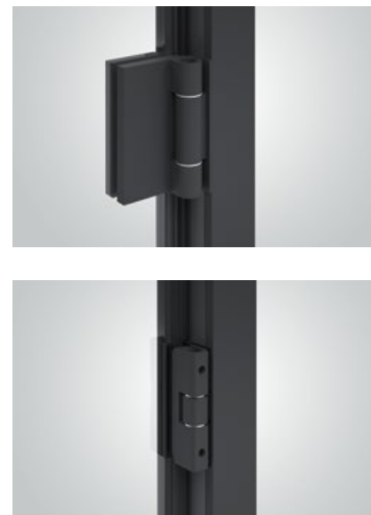
▲ The new UNIQUIN hinges generation Hinge up to 130 kg (left) 80 kg (right) door weight