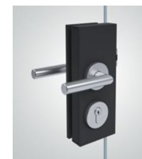
UNIQUIN lock 2023 MultiVar A lock with many possibilities, for more freedom and flexibility.