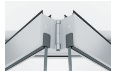
◀ FSW EASY Safe Ideal for linear layout