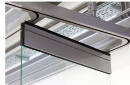
◀ HSW EASY Safe After being moved individually all panels stand in the park position. The dividing wall between inside and outside disappears.