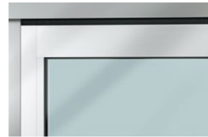
◀ HSW FLEX Therm Thermally insulated closure as desired. Weather and well-being alone decide whether the wall is open or closed.