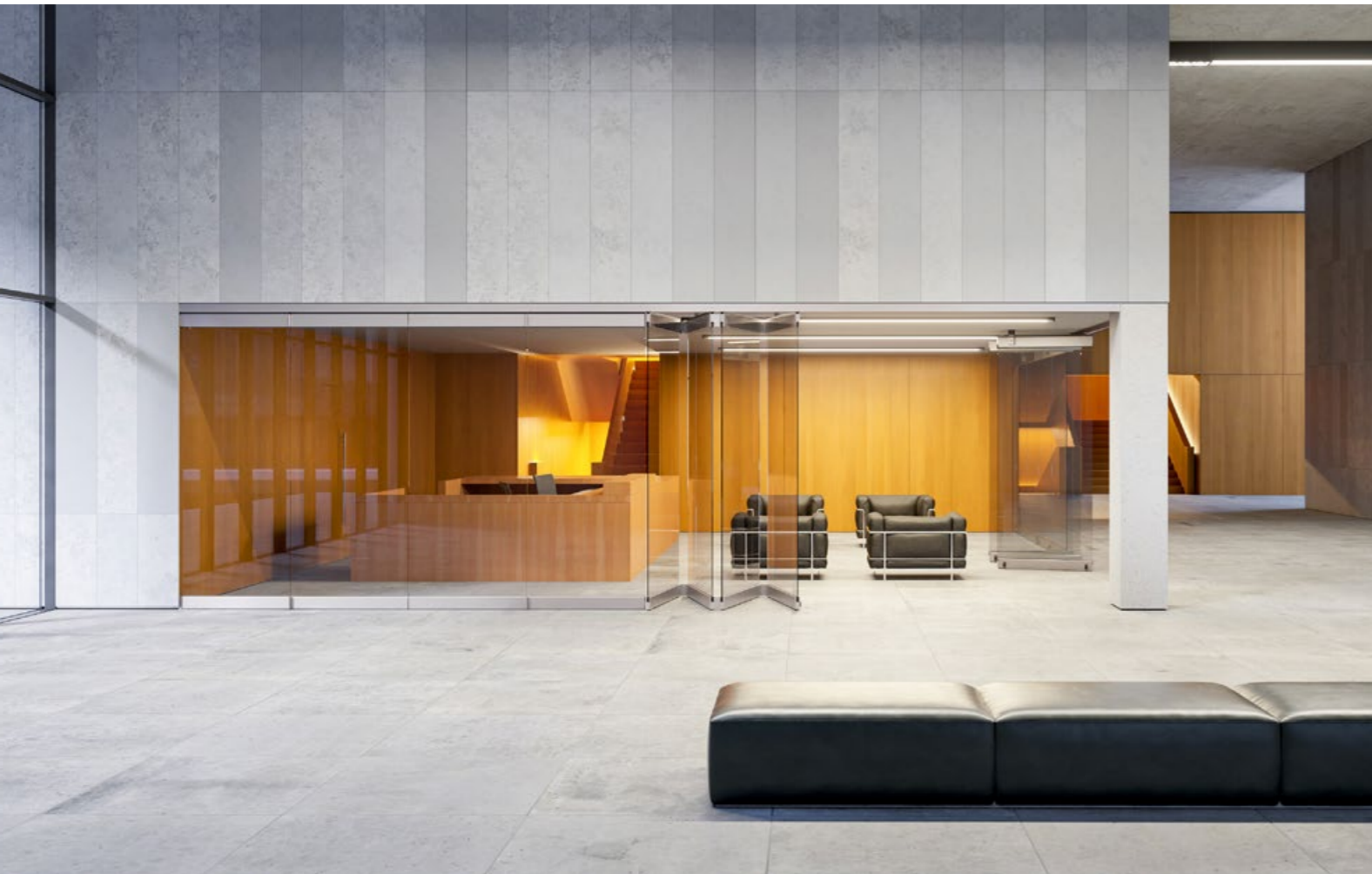
◀ FSW EASY Safe Ideal for linear layout