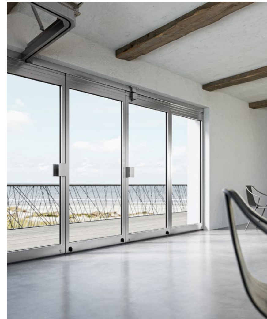
◀ HSW-R The fixed sliding panels quickly become hinged doors for access when the wall itself is closed.